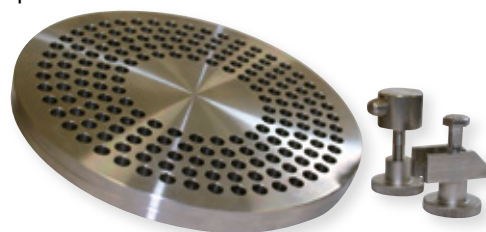
Examples for application