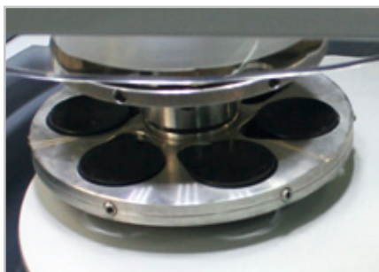
Central pressure requires levelled samples