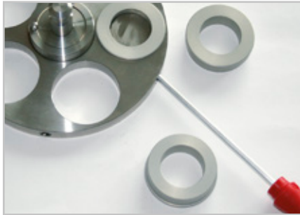
Insert suitable distance rings