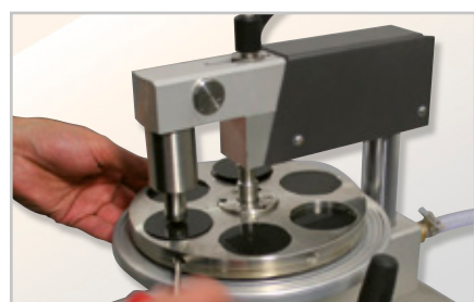
plan und einfach fixieren