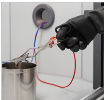
Use with external etching unit

Option for connecting an additional and an external etching unit increases time saving applications. The chemical-resistant plastic vessels, also for storage of the electrolytes, are quick and easy to change.