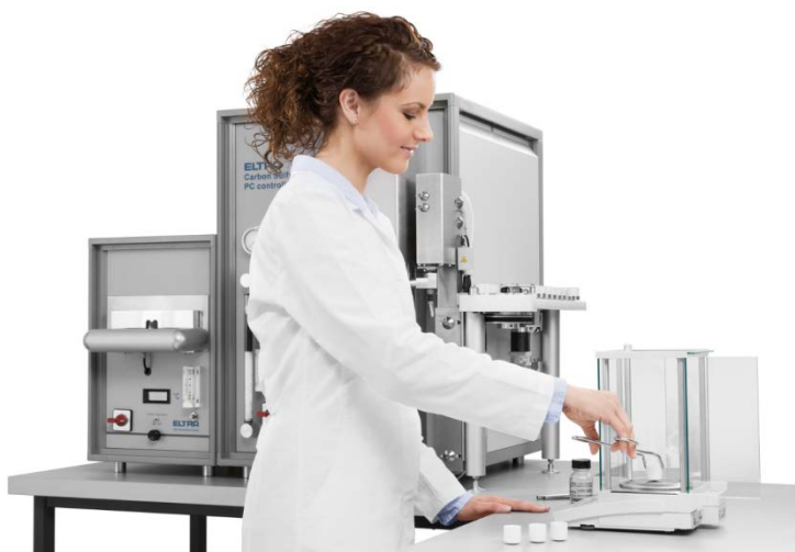
Fig. 2: CS-2000 for simultaneous analysis of carbon and sulfur in organic and inorganic samples.

The measurement of C, H, N, S, O concentrations with combustion analyzers is separated into C/S analysis and N/O/H analysis. Pure chemical substances or pure gases are suitable calibration materials for both methods. For calibration with gas a defined volume of, for example, CO 2 is introduced and directly guided to the measurement unit without entering the furnace. Both methods allow for a daily calibration update, or the existing calibration can be updated with a daily factor. In contrast to spark spectrometry there is no strict matrix dependency. The user can easily exchange the used standards against others. For C/S analysis the sample is mixed with additives such as tungsten or iron, introduced into the induction furnace, combusted in an oxygen stream, and finally the resulting reaction gases CO 2 and SO 2 are detected in the infrared cells. ELTRA's CS-2000 offers a combination of inductive combustion with a resistance furnace (fig. 2).