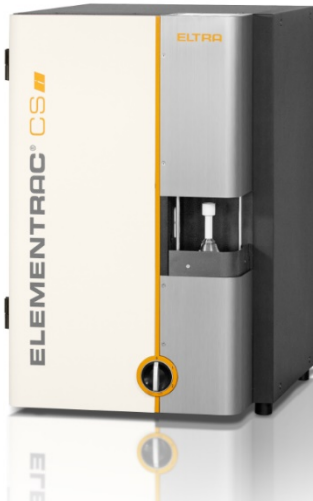
Fig. 1: Carbon / Sulfur Analyzer CS-i

However, there is no universal combustion analyzer available in the market which can measure all elements. A further differentiation with regard to the