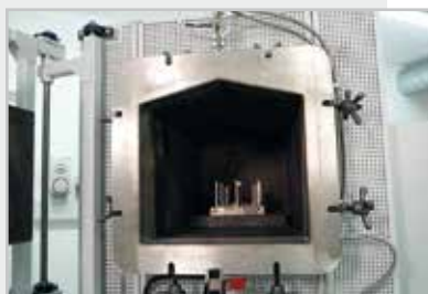
View into a metal retort of the GPCMA/174 with additive manufactured sample to be stress relieved