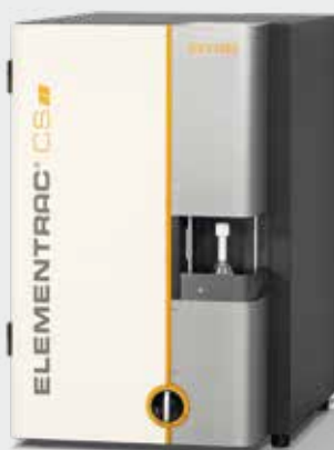
Carbon / Sulfur Analyzer ELEMENTRAC CS-i

In the induction furnace the sample is melted in a pure oxygen atmosphere; combustion gases are purified and sulfur dioxide is detected in the infrared measuring cells. After oxidation of CO to CO 2 , and of sulfur dioxide to sulfur trioxide, the SO 3 gas is removed and the carbon content is reliably detected in the IR cells.