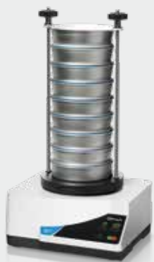
The vibratory sieve shaker AS 200 basic is suitable for separating metal powders into size fractions