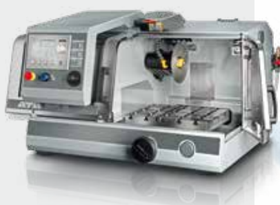
Cutt-off machine Brilliant 220