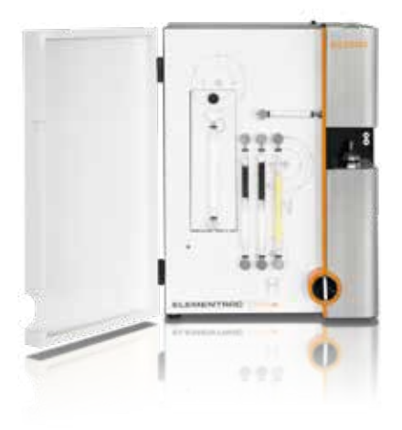
Fig. 1: ELEMENTRAC ONH-p