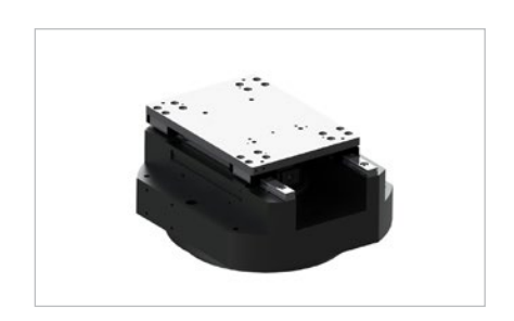
Linear Reciprocating Motion Drive