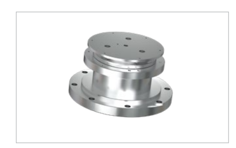
Rotary Motion Drive