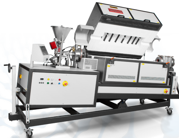
Figure 2: RHZS Rotating Horizontal Tube Furnace

Time in the heated zone(s) depends on the pitch angle of the tube (horizontal to 10°), the rotation speed (1.5-10 rpm), the length of tube used (600 mm, 900 mm or 1000 mm) and the flow properties of the raw materials as they are heated and mixed. The final heated and mixed clinker is delivered to a hopper where it can be cooled.